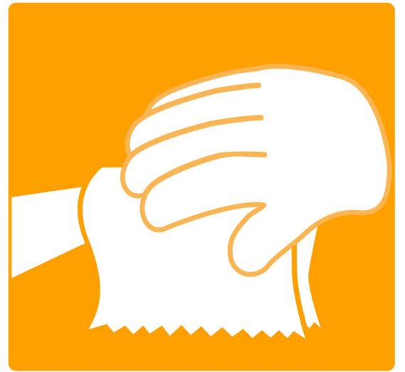
6. turn off water with paper towel