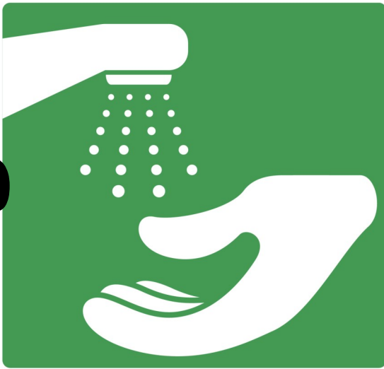
1. Wet hands