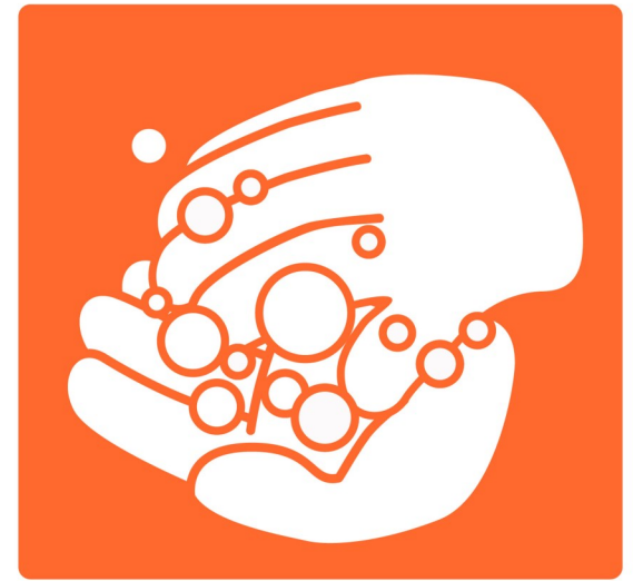
3. Wash for 20 seconds