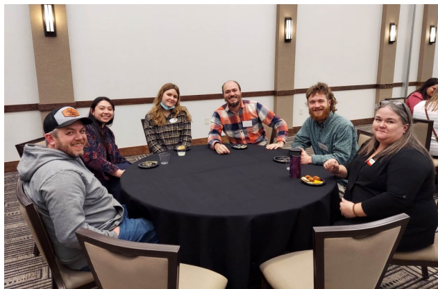
Attendees at the 2023 NCR FSMA annual meeting.

~ Food Safety Professional, referring to the impact of the NCR FSMA network